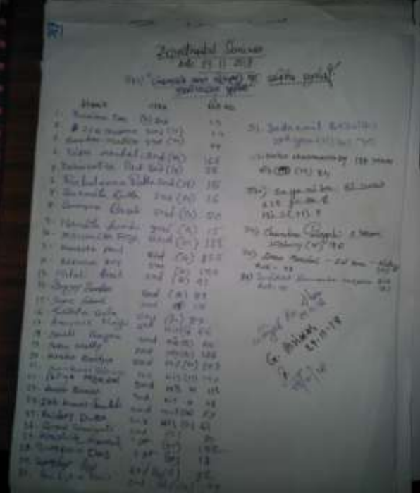
DEPARTMENTAL SEMINAR 29.10.2018