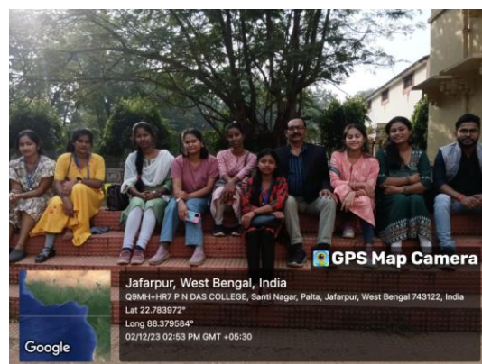
Educational Tour of Bolpur, Shantiniketan

17. Evidence produced (Lists, Certificates, letters, newspaper cuttings, etc.):