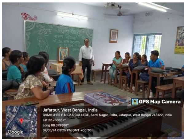
Rabindra Jayanti Celebration

16. Photographs (with captions) submitted (number):