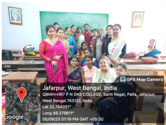
Teacher's Day celebration

16. Photographs (with captions) submitted (number):