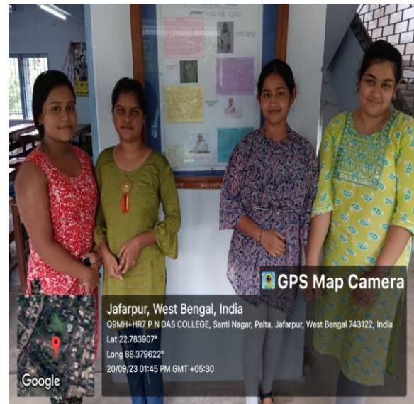
Wall Magazine about women writers of Bengali Literature.

17. Evidence produced (Lists, Certificates, letters, newspaper cuttings, etc.):