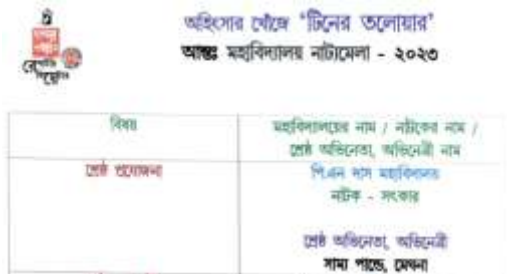
Result of The Program